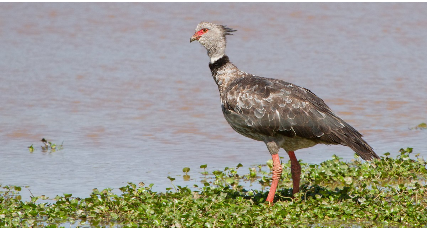
Southern Screamer