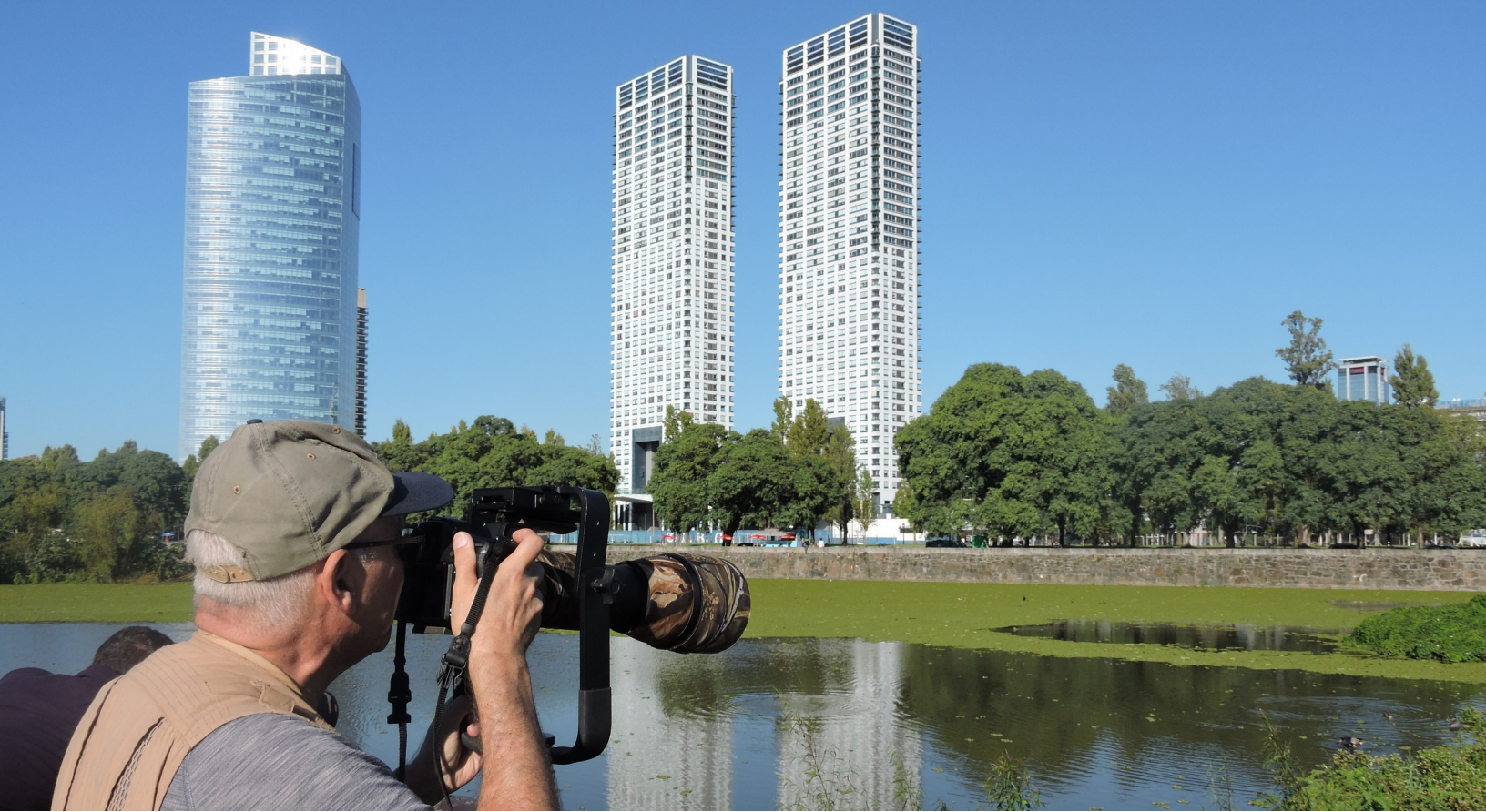
Bird photography at Costanera Sur reserve

austral summer to austral winter. Costanera Sur reserve does not open on Mondays, rainy and strong windy days, days after strong rain and several national holidays. In those cases we still recommend to take this tour, birding from the outside along the front promenade, especially if it's your only chance for a visit.