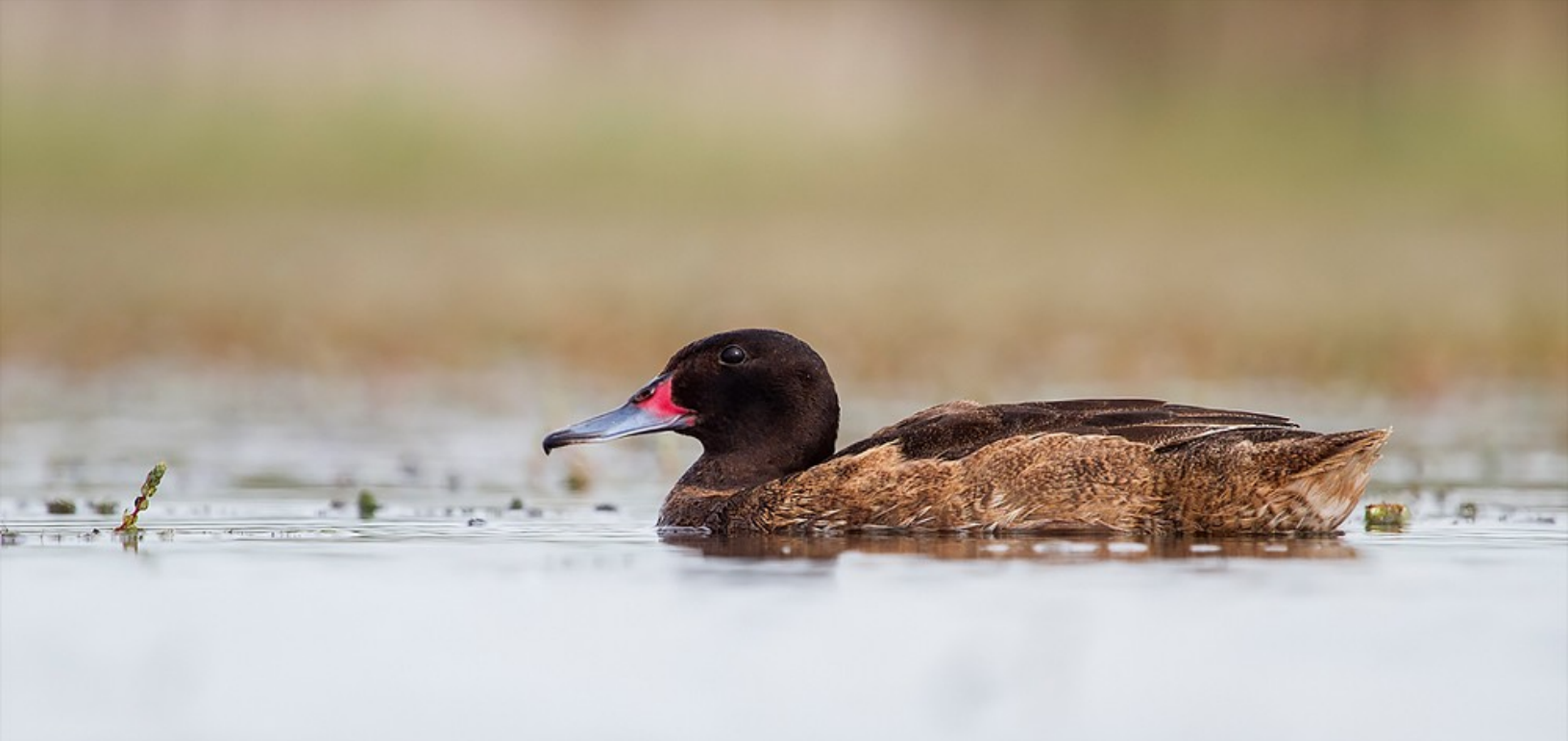
Black-headed Duck