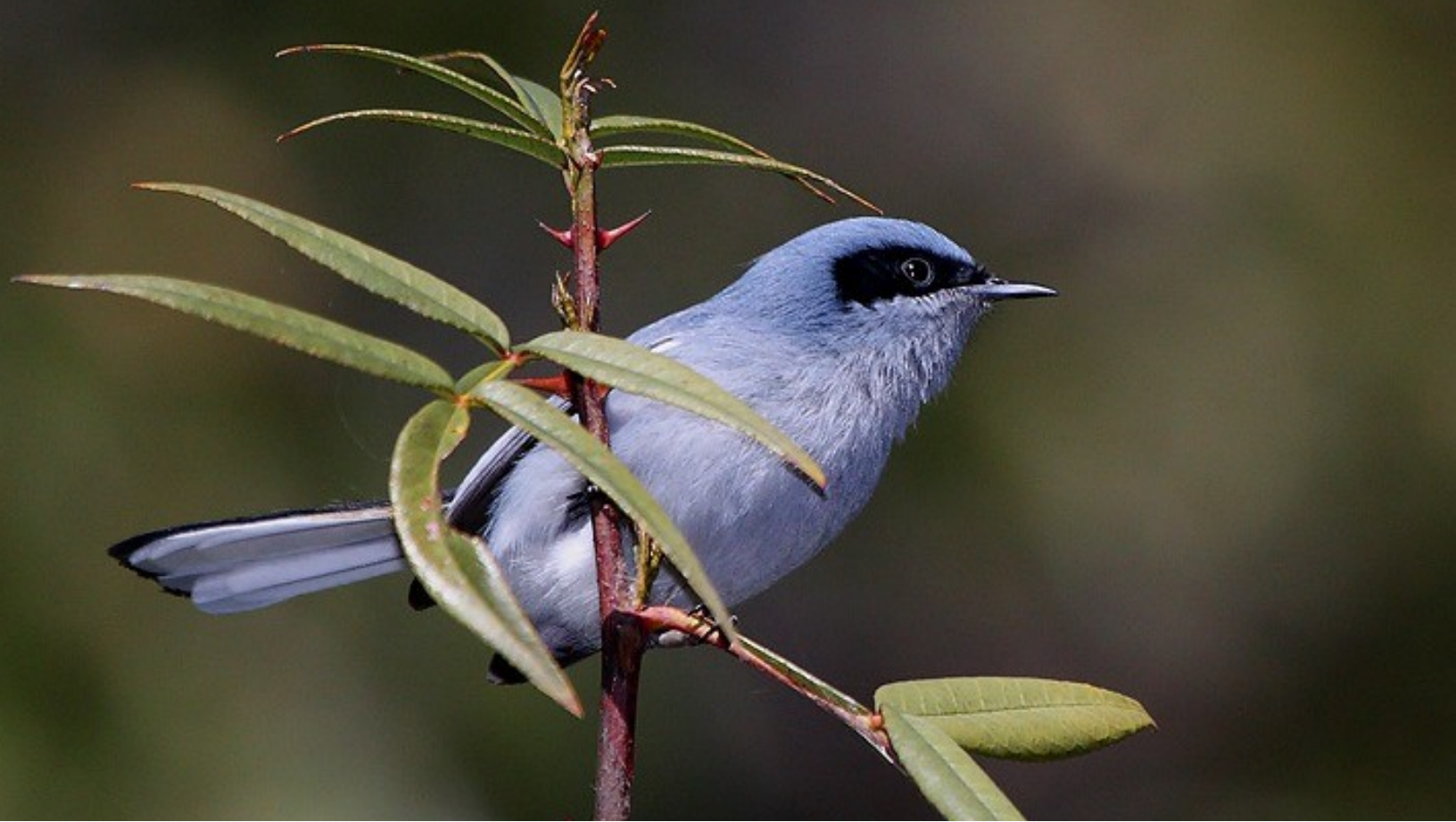
Masked Gnatcatcher