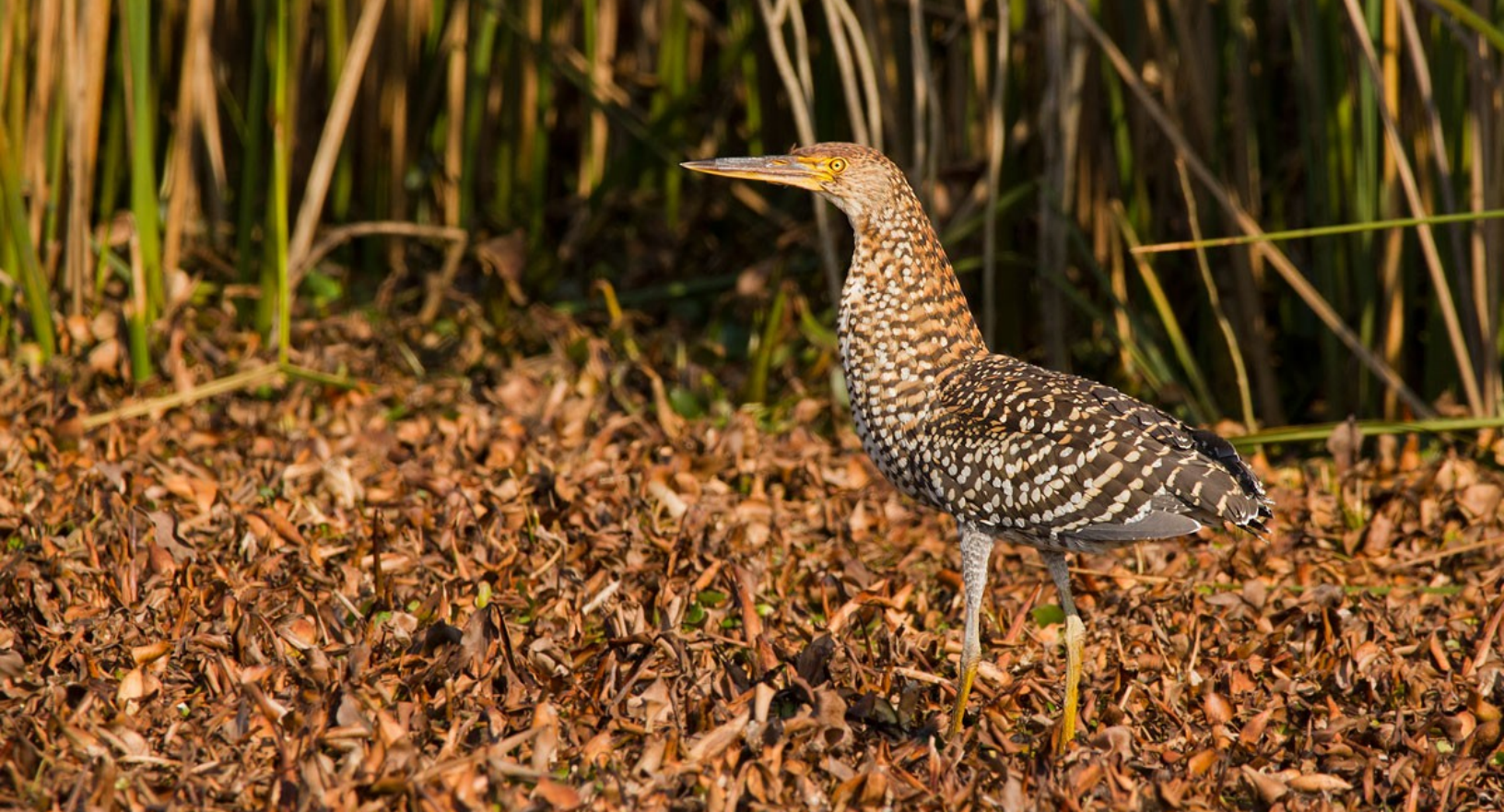
Rufescent Tiger-Heron (juvenile)