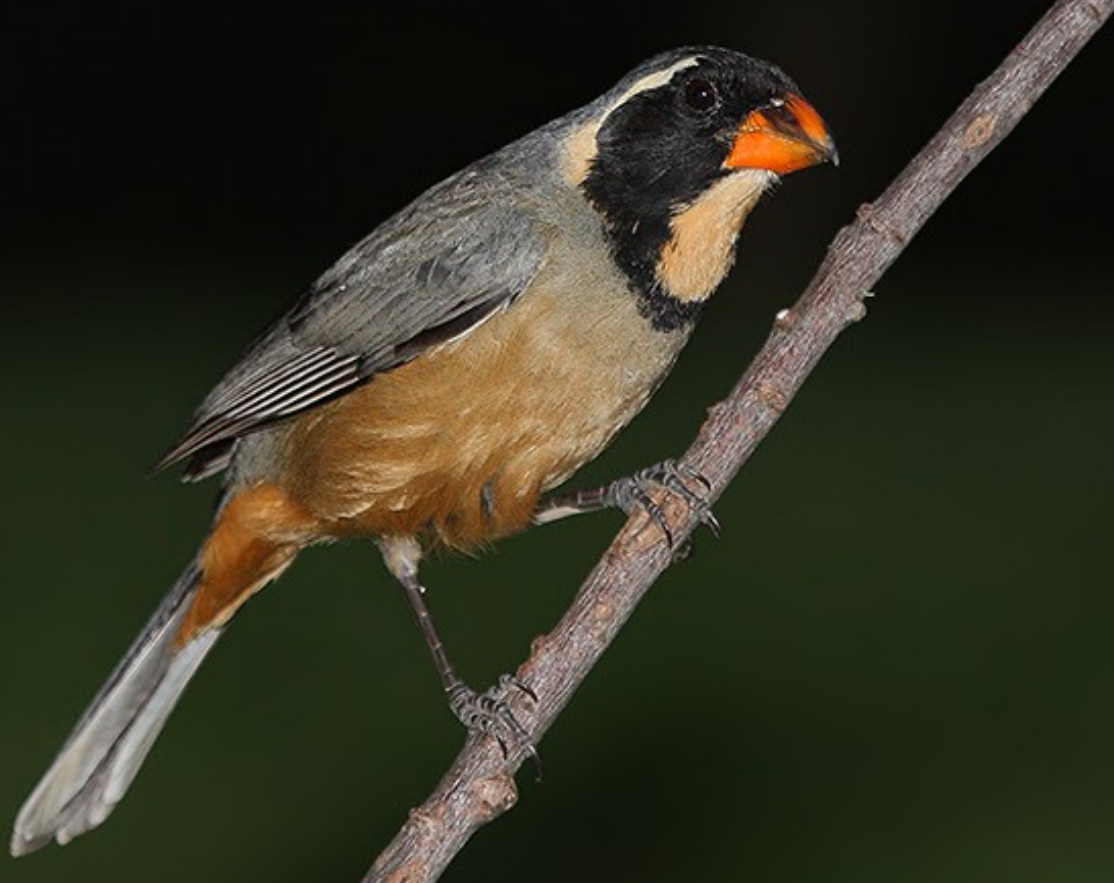
Golden-billed Saltator